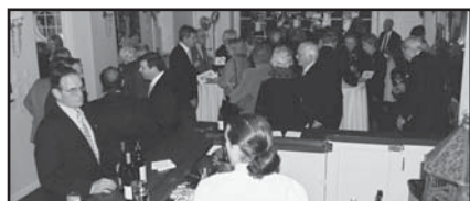
A group shot from last year's 10th Annual COPE Benefit at the Papermill Playhouse. It was definitely a "wonderful" evening. This year's 11th Annual Benefit will be "A Night to Remember," too!

We hope you will join us for an entertaining evening and participate in COPE's major fundraising event of the year.